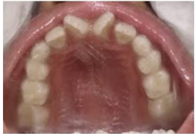
Fig. 2: Palatal view-rotations with 11,21

History did not reveal any previous trauma in that region. Extra oral examination in a lateral view displayed patient with slightly convex profile and competent lips and in frontal view, he was mesoprosopic. Intraoral examination revealed vital 11 and 21 with mesiolabial rotations (Figure 2). Mandibular occlusion was noted as Angle Class I with crowding in lower anterior teeth region with more than 70° rotation of right and left maxillary central incisors (Figures 3 and 4). Orthopantomogram revealed both the central incisors were young permanent teeth with a \frac{3}{4} of root completion in relation to 21 and root almost completed in relation to 11. In the radiographic examination of OPG