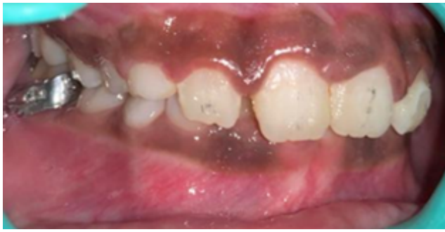
Fig. 10: Brackets debonded-lateral view