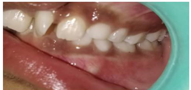
Fig. 4: Left lateral intra-oral view

and lateral cephalogram (Figures 5 and 6), pathologic problems such as supernumerary teeth or odontoma were not discovered; skeletal relationship of the patient was Class I with mandibular plane angle in a nominal range. Alginate impressions of both arches were taken to fabricate study and analyze the study models for space, and no space deficiency was found. Rotated teeth showed early stage of root development and there was enough space in the upper arch to derotate it.