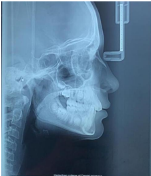
Fig. 6: Lateral cephalogram