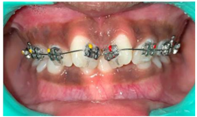
Fig. 7: Roth 0.018 Brackets bonded- frontal view

The lingual arch space maintainer was planned and given for the mandibular arch crowding of lower anteriors and maintenance of arch length. The patient was called after one month of bracket and wire placement and significant derotation was observed with the maxillary central incisors; the 12 NITI wire was continued till gross rotation was corrected with 11 and 21. The wire sequence followed after