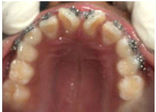
Fig. 8: Roth 0.018 Brackets bonded- lateral view

this was 14 NITI, 16 NITI and 16SS and the brackets were debonded after 6 months (Figures 9 and 10). The fixed permanent lingual retainer with 11 and 21 was bonded at the cingulum level (Figure 11). The child and parents were happy with the results and patient was recalled after 3 months for follow-up.