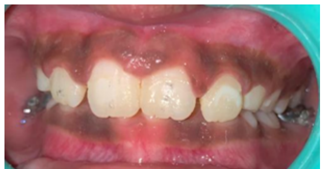
Fig. 9: Brackets debonded-frontal view

this was 14 NITI, 16 NITI and 16SS and the brackets were debonded after 6 months (Figures 9 and 10). The fixed permanent lingual retainer with 11 and 21 was bonded at the cingulum level (Figure 11). The child and parents were happy with the results and patient was recalled after 3 months for follow-up.