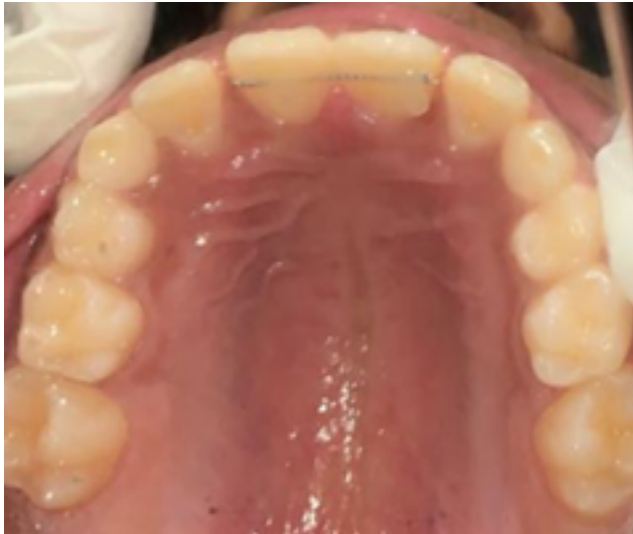
Fig. 11: Fixed lingual retainer with 11, 21