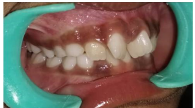
Fig. 3: Right lateral intra-oral view